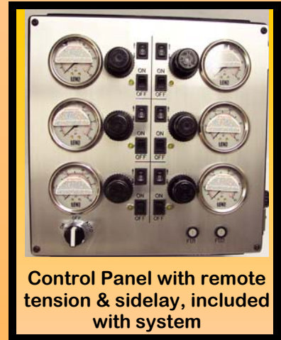
Control Panel with remote tension & sidelay, included with system

Hundreds of Installations Call for Quote!!!